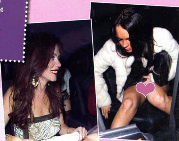
Anna Friel (left) and Lindsay Lohan (above) leave nothing to the imagination

Caught on camera without any underwear these celebs redefine overexposed